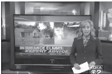
Consumers benefit when investigative reporters cover insurance stories